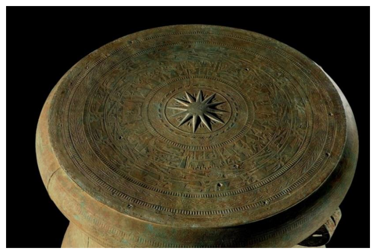
The Ngoc Lũ bronze drum

radiating a multitude of rays. Engraved in sixteen concentric circles decorated with geometric figures are various drawings depicting people clad in bird feathers, playing musical instruments, dancing, or grinding paddy.