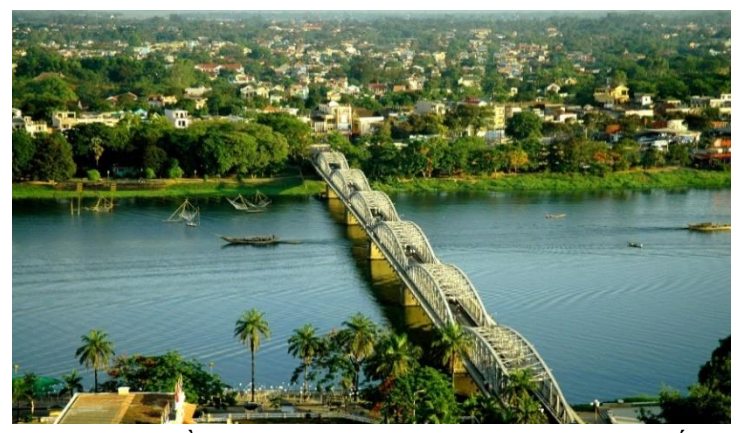
Tràng Tiền bridge across the Perfume River in Huế

The citadel of Huế is delimited by three belts of walls forming three non-concentric squares laid out on a central northwest to southeast axis, each of which encloses a dictinct area. Within the outer walls are the seats of government departments and other public offices of the central administration, as well as the royal garden and the "Pond of Meditation" (Hồ Tỉnh Tâm).