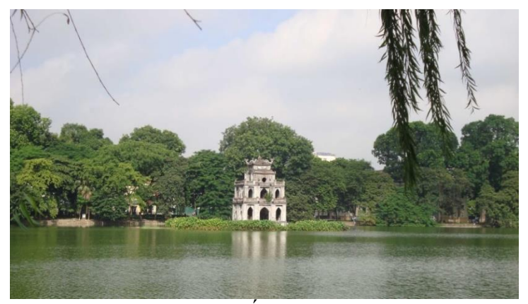
The Hoàn Kiếm lake in Hà Nội

gained its independence. The city is the home of numerous historical vestiges, above all, the temples built in memory of Confucius and his disciples, or those dedicated to the worship of national heroes, and the ancient pagodas built during the glorious centuries of Buddhism. The French of the colonial days have equally bequeathed white villas along wide, quiet and shady streets.