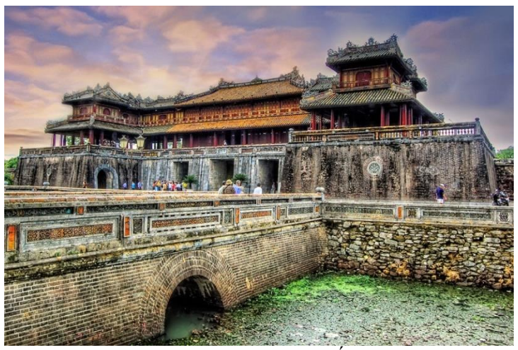
The citadel of Huế

Scattered around Huế, tombs of past sovereigns had been built on hills overlooking a green and beautiful landscape, combining human works and nature in a perfect harmony. The main tombs are those of Emperors Gia Long, Minh Mạng, Thiệu Trị, Tự Đức and Khải Định. As a rule, the monarchs, while still alive, personally chose the sites of their burial and supervised the construction of the royal tombs.