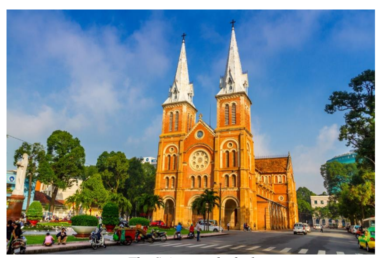
The Saigon cathedral

Saigon, an economic capital of the former Indochina Union, has acquired in the course of its existence a well-developed commercial spirit and a somewhat anarchistic dynamism. It became the capital of South Vietnam when the country was divided into two states in 1954 as a result of the Treaty of Geneva, and continued to develop and prosper with American aid in the midst of the troubles and the torments of a constantly intensifying war. The city was renamed Ho-Chi-Minh City after the communist take-over of South Vietnam in 1975, reflecting a personality cult dedicated to the old revolutionary who led the country in the way of Marxism-Leninism.